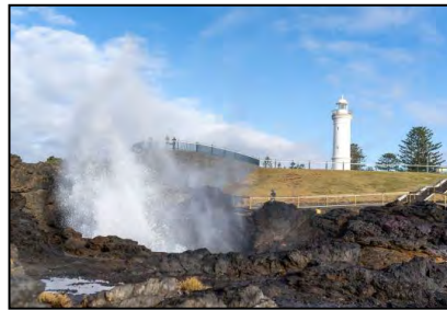
Kiama Blowhole and Lighthouse