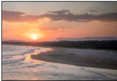
Seven Mile Beach